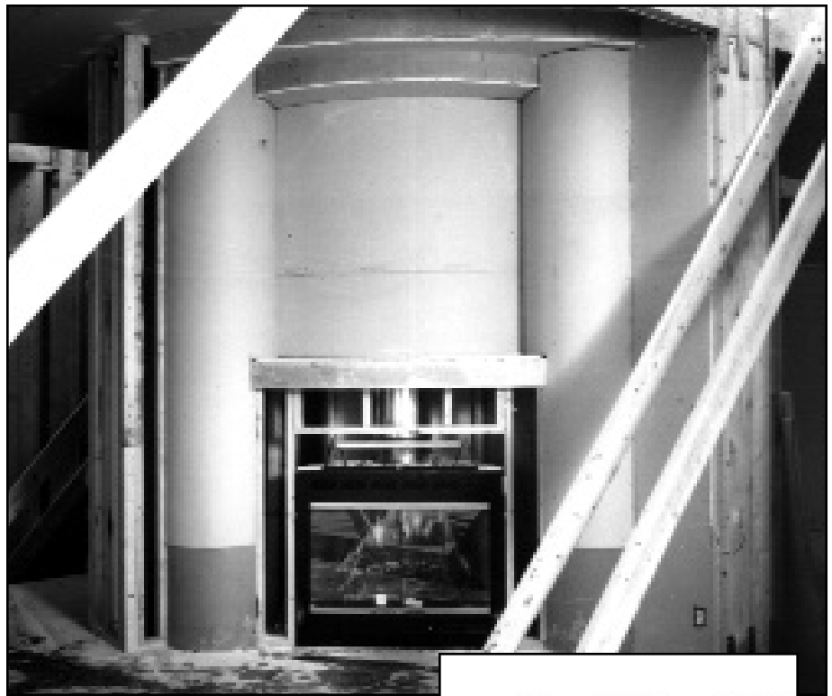
The new Gold Bond 1/4" High Flex Board was put to the test by the installation of the great room fireplace, whose curved columns, flanking walls and niche featured exceptionally tight radii.

Use of the new flexible wallboard dramatically reduced the time and labor required by standard, non-flexible wall panels. The new High Flex Board installed and finished as easily as regular gypsum wallboard. Tapered edges allowed for quicker, easier joint compound application. The final surface—whether curved walls, arches, columns or ceilings—was easily primed for painting or spray texturing.