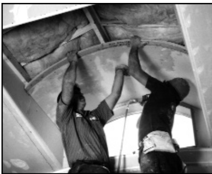
The spacious 2,240 s.f. MO-8 Manor Home by Silvercrest offers competitive design features not previously offered, including a 13-1/2-foot high barrel-vaulted ceiling in the foyer and master bedroom.

GOLD BOND SOLUTION: To construct the signature curved walls and ceilings of this semi-custom Manor Home series (retail $100,000+), Silvercrest had traditionally used the more costly and less reliable process of wetting and scoring non-flexible board to achieve the home's tight-radius surfaces. Other alternatives were precast fiberglass-reinforced gypsum panels or lath and plaster.